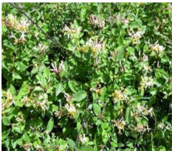
Honeysuckle in a World's End hedgerow

2.15 The hamlets at World's End and Furzeley Corner had their own Post Offices and shops.