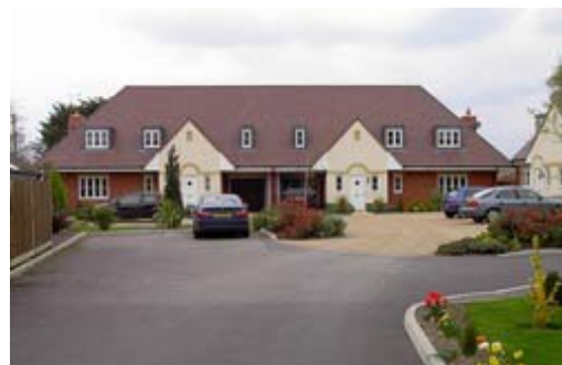
A modern but different approach to backfill development close to the village centre.