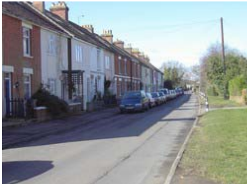
Anmore Road, one of the older village ribbon developments, with no parking spaces and on a “rat-run”.

8.7 Pedestrians are not well served in most of Denmead. The Forest Road development does provide access to both the village shops and schools in safety.