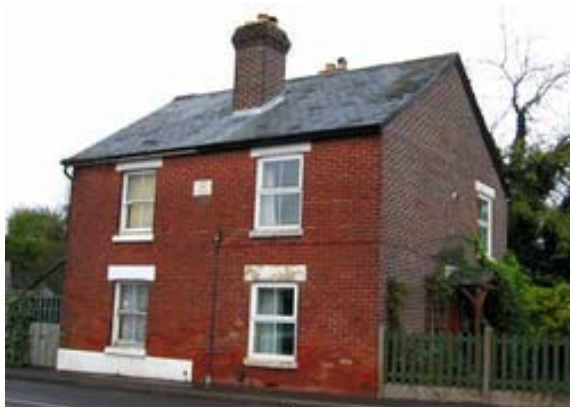
Lynden Cottage of the 19th century. Brick with slate roof, and sash windows.

3.15 Shop fronts and business premises have discreet painted signage above their windows. Some small hanging signs also exist.