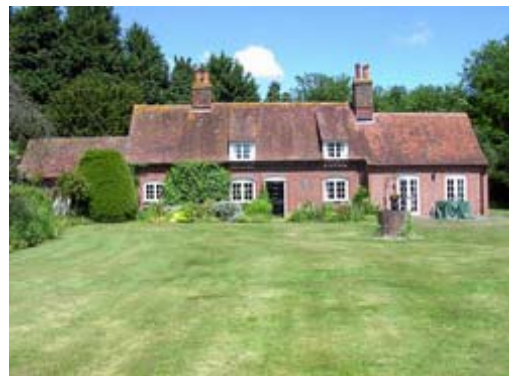
This tastefully renovated and extended building is in World's End