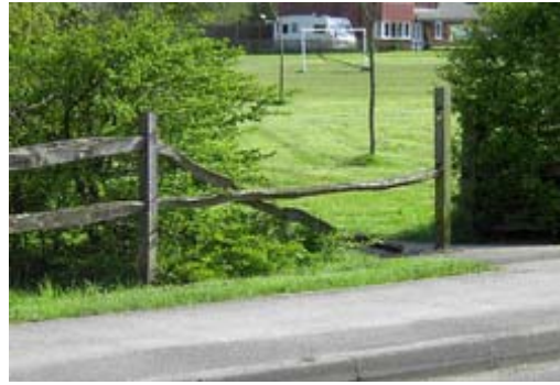
Post and rail fencing leaving the Parish Council with a high maintenance cost.

5.14 The landscaping has succeeded in making an attractive soft edge to the village with plentiful wildlife to be seen by the sharp eyed.