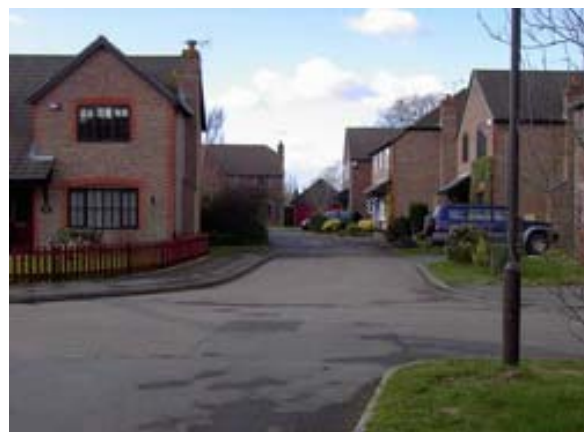
A back-fill development. Like many such estates there is a lack of children’s play facilities.

4.5 This section covers that part of the parish which to many people constitutes Denmead and is within the policy boundary shown in the Neighbourhood Plan. Parts specifically excluded are those dealt with elsewhere namely the Village Centre and the Forest Road Development.