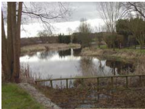
Willow Lake, World's End

due to a combination of spring lines (not all of which are in the lowest parts of the parish) and the high water table.