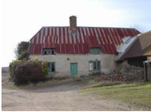
This derelict building had consent for renovation/conversion. The countryside benefits from such buildings brought back into use.