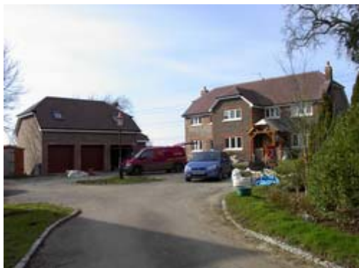
A renovated building (from the same group of farm buildings as above) is clearly better for everyone.