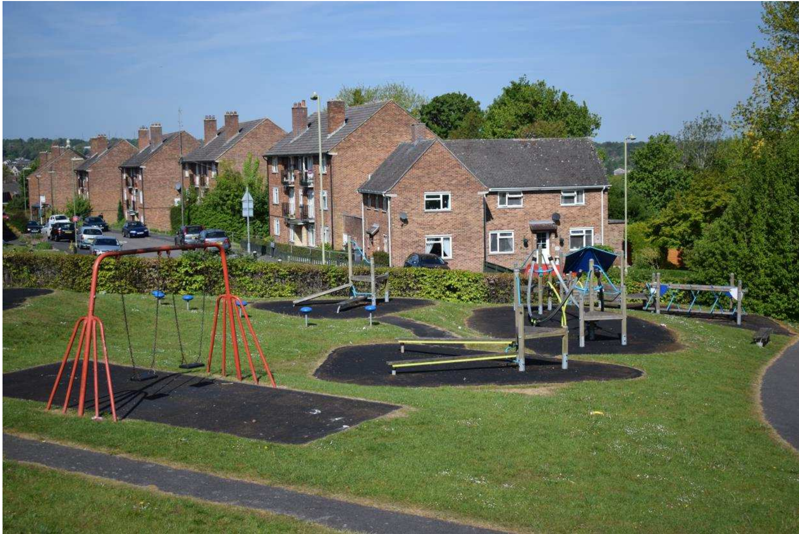
Winnall Manor Road - before