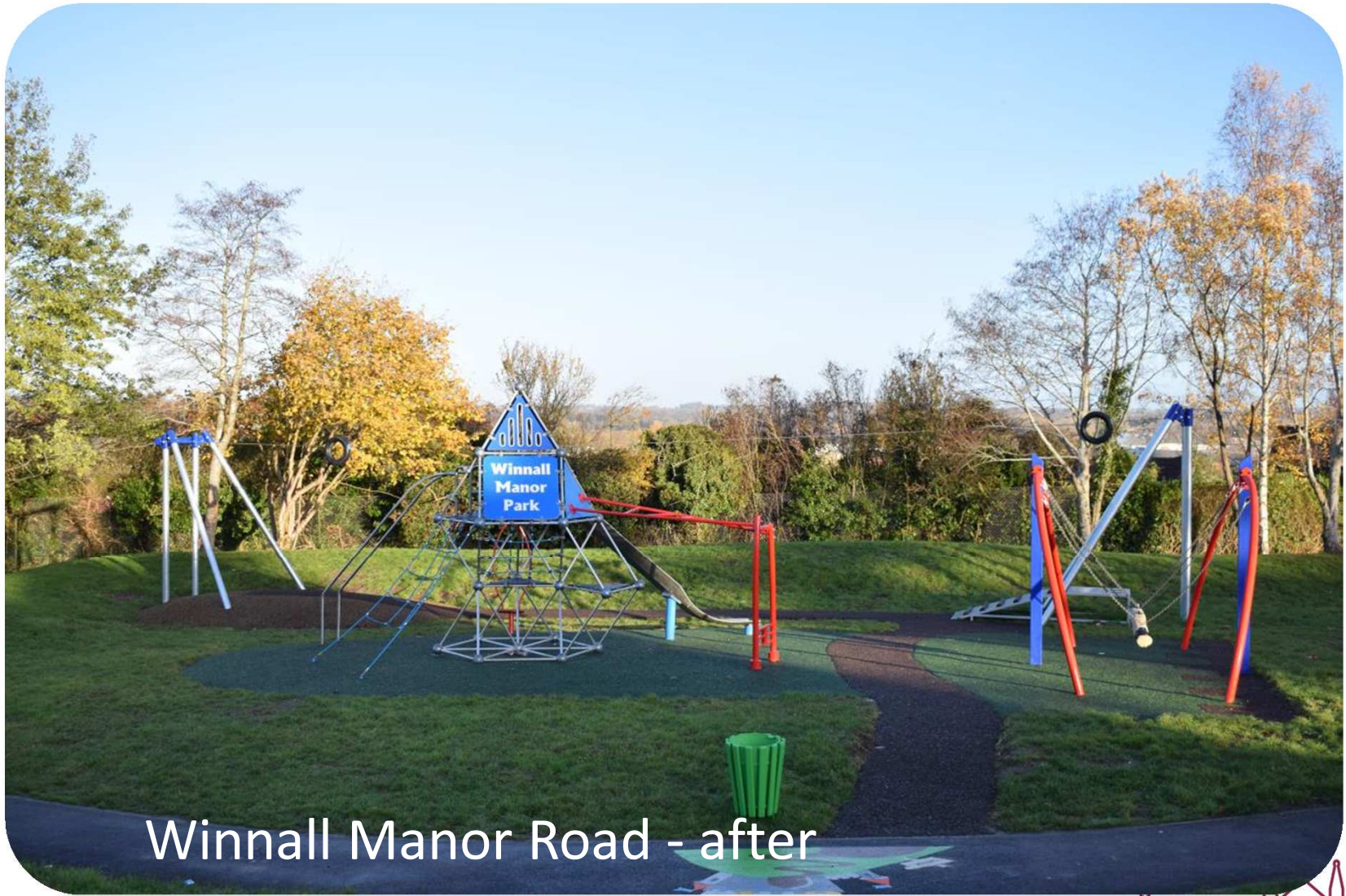
Winnall Manor Road - after