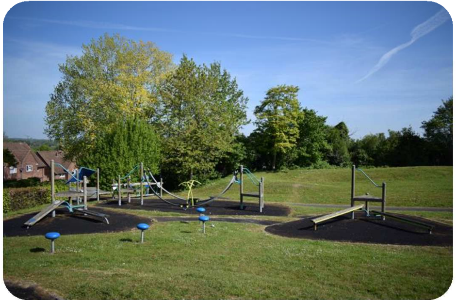
Winnall Manor Road - before