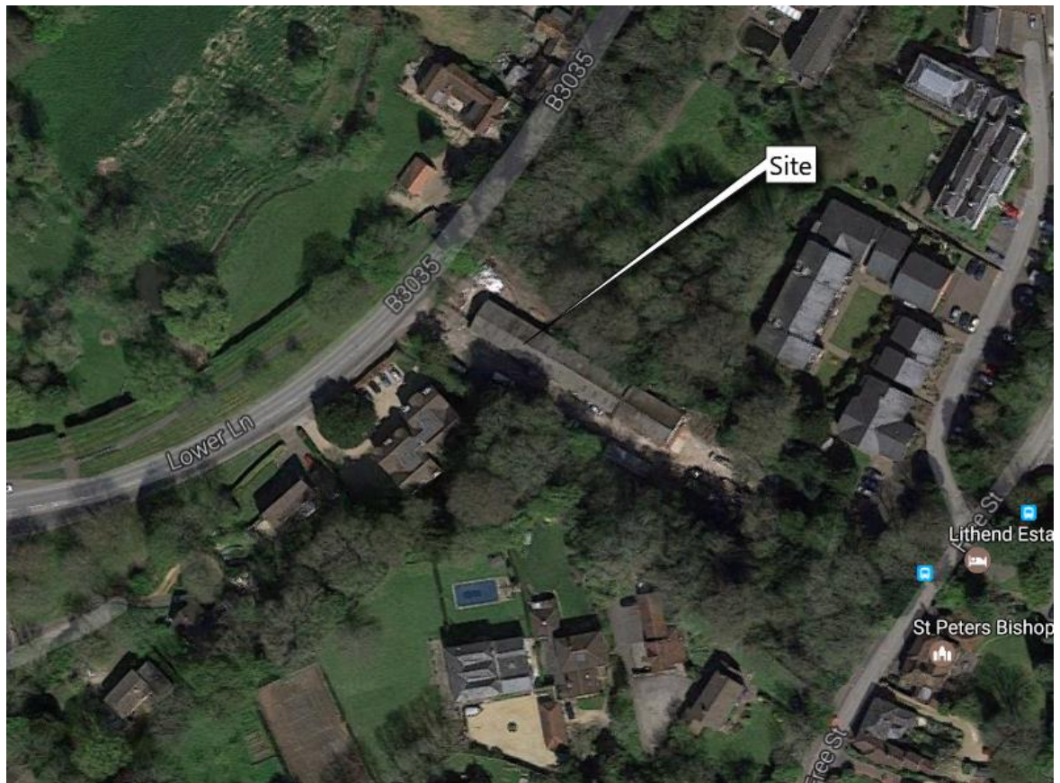
Aerial View of Site, Image from Google Maps