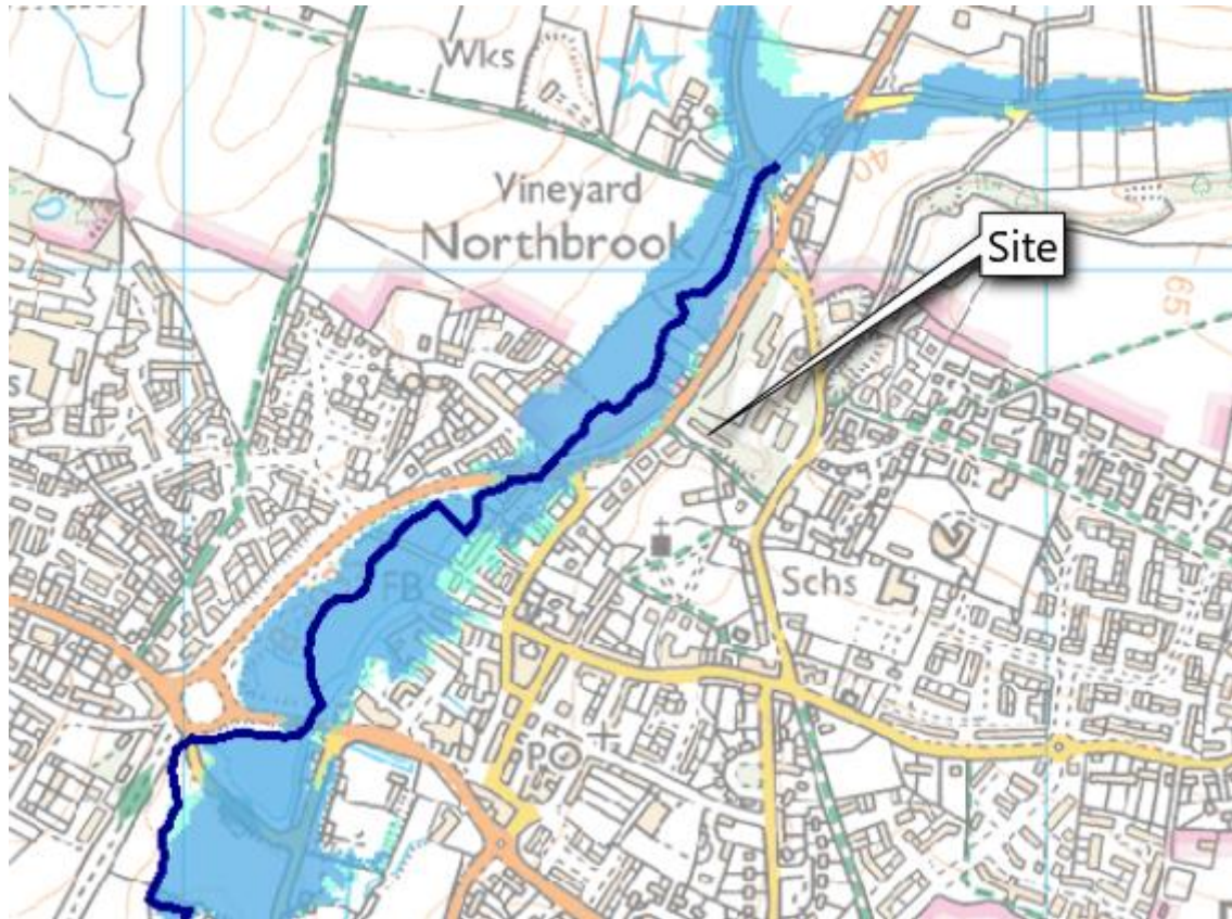
Surface Water Flood Risk Map