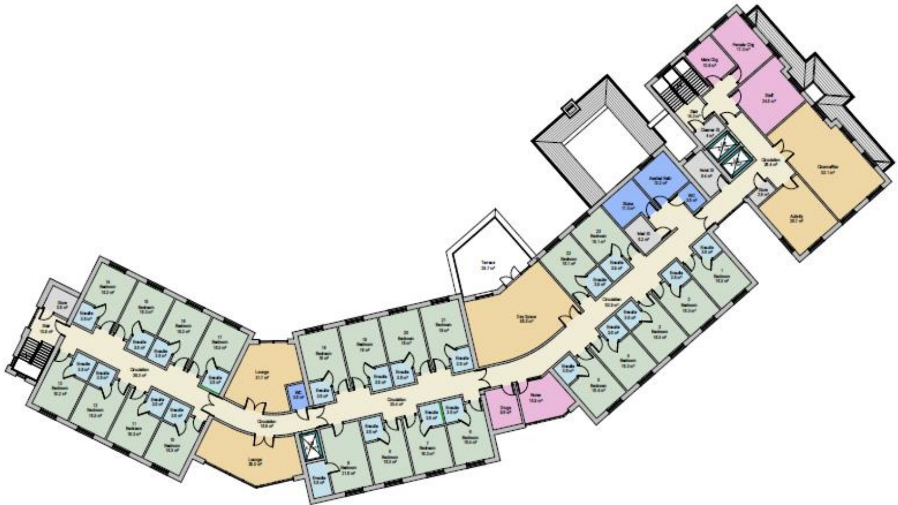
1 First Floor General Arrangement 1 : 125