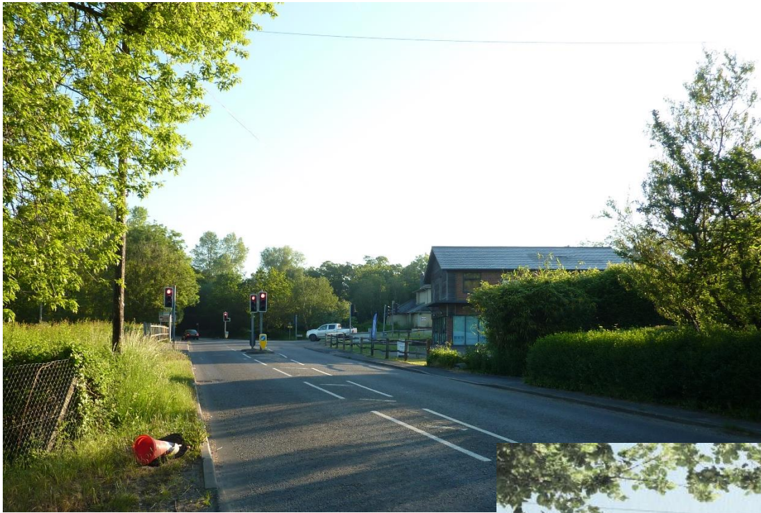
View looking north along Winchester Road