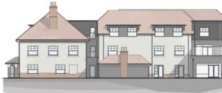
Block 1 & 2 Rear 1 : 125