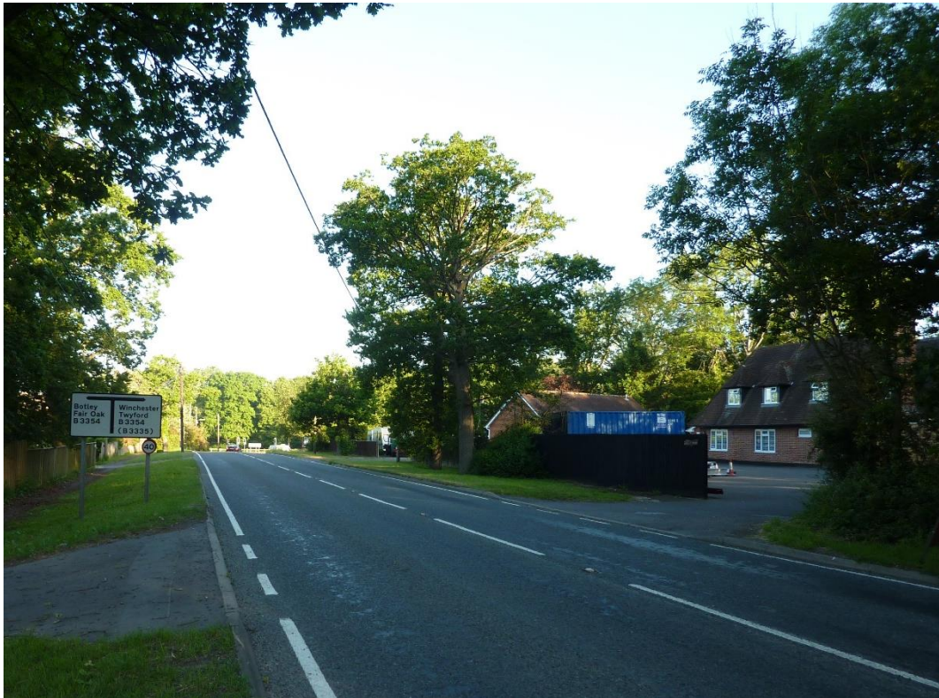
Looking west towards junction of Portsmouth Road and Main Road/Winchester Road