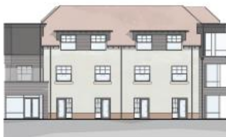
Block 3 Rear 1 : 125