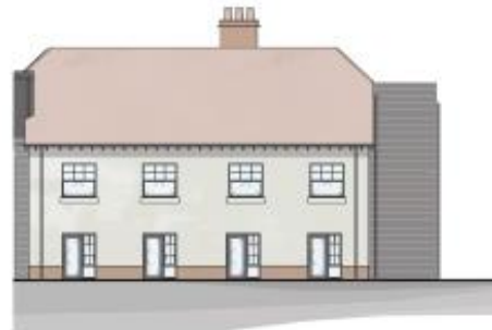
Block 4 Rear 1 : 125