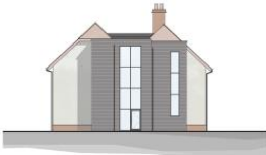
Block 4 End 1 : 125