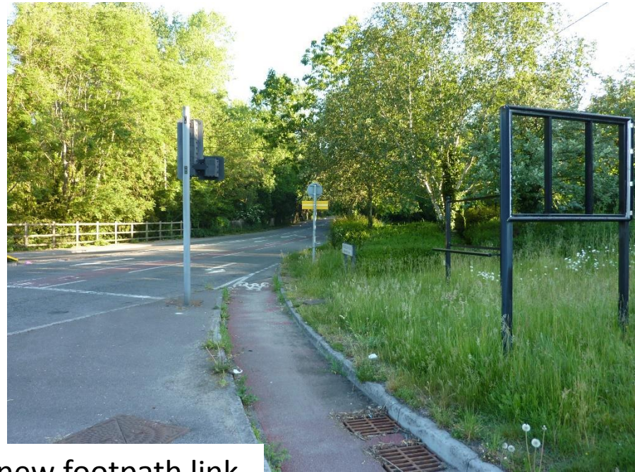
Route of proposed new footpath link