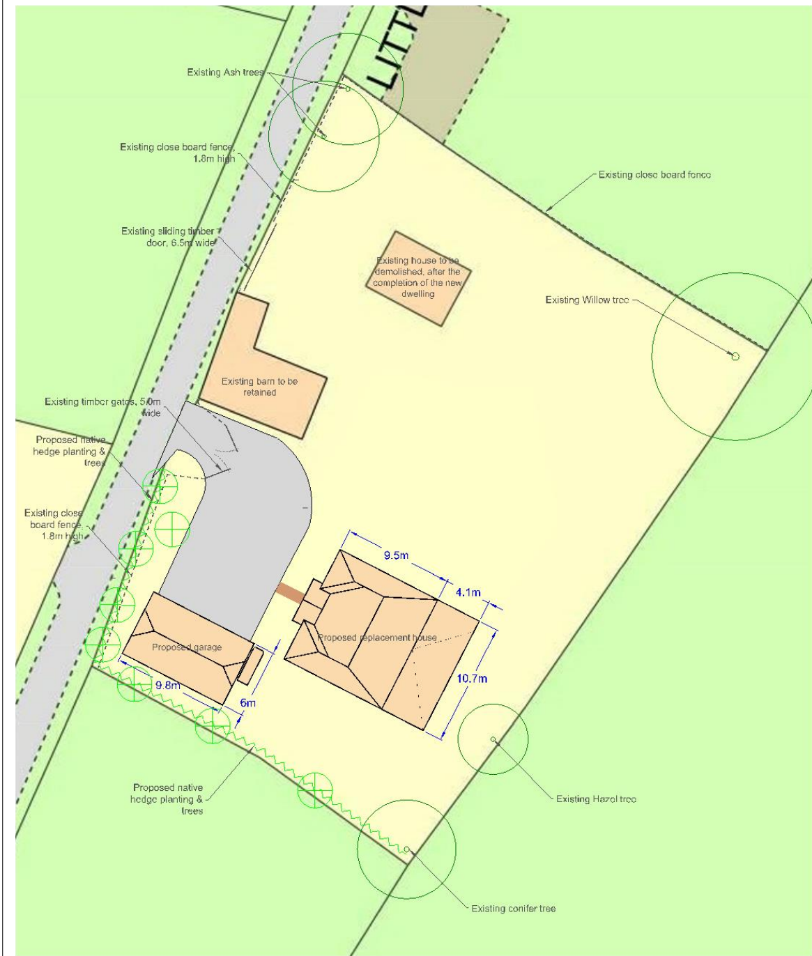
Site layout plan (Scale 1:250)

Note: All drawings are for planning purposes only, not to be used for building control or construction uses