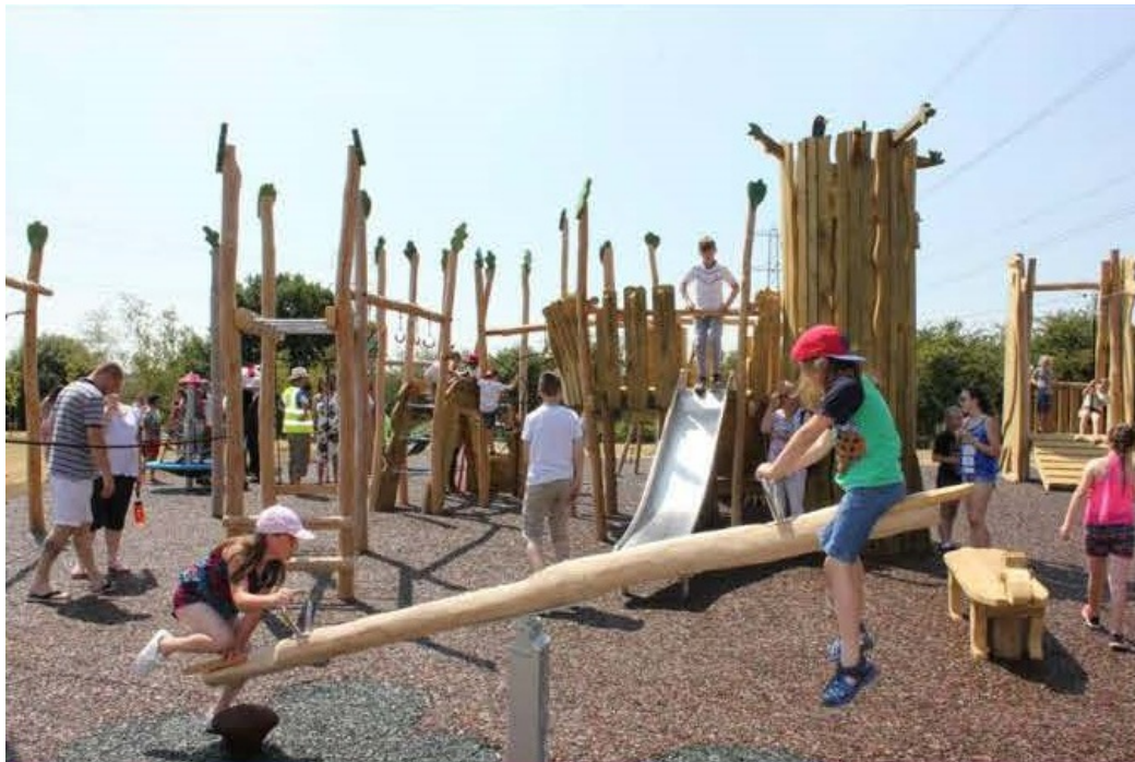
11.31 New play area at Newlands Walk.