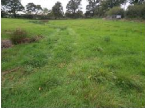
View looking East to West