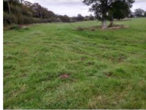
View looking West to East