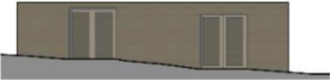
West Elevation 1 : 100