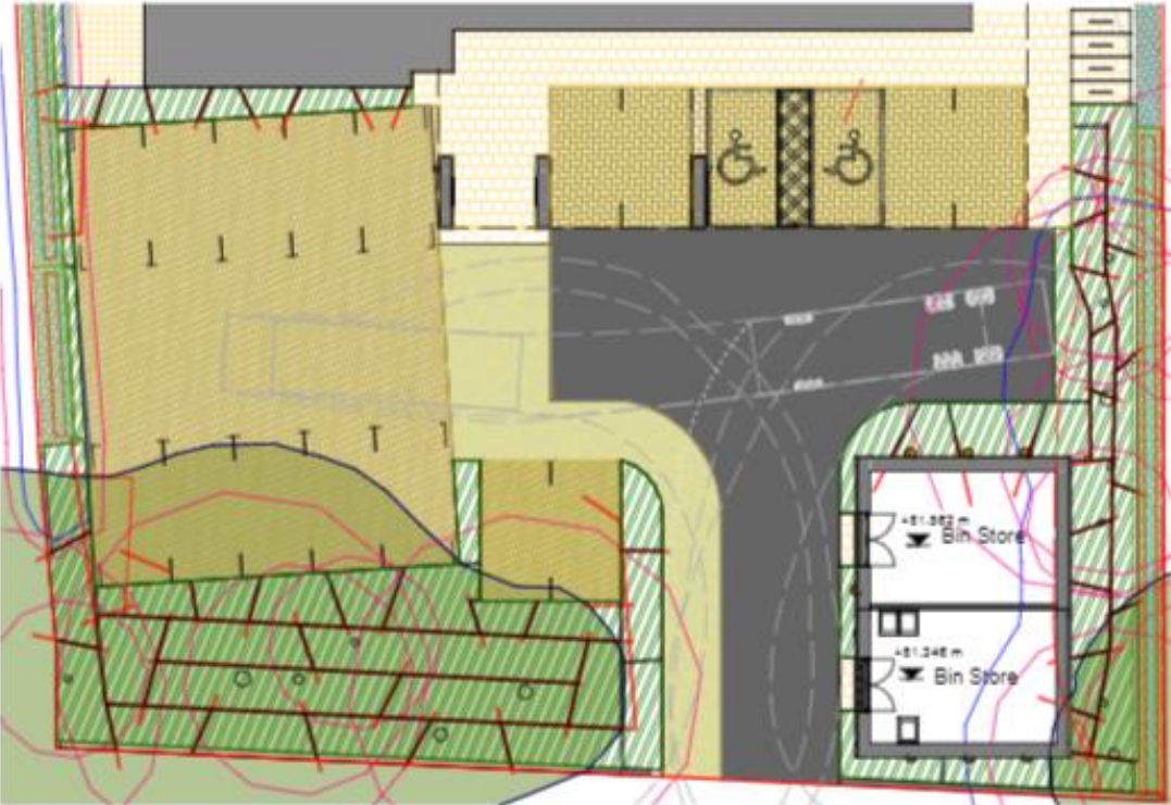
Proposed Bin Store & Substation Plan 1 : 200