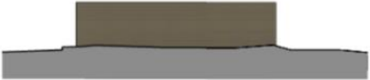
North Elevation 1 : 100