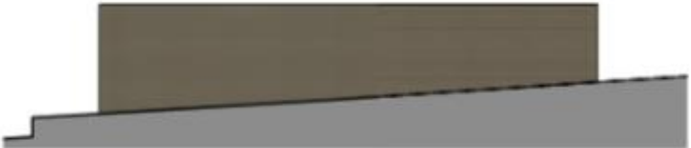
East Elevation 1 : 100