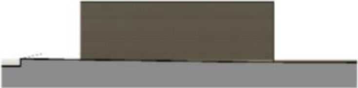
South Elevation 1 : 100